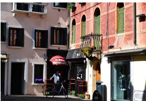
Above Photos: Downtown Mestre where we are evangelizing, Satellite view of Venezia Mestre, Jeryvee and Cornelius, Downtown Mestre